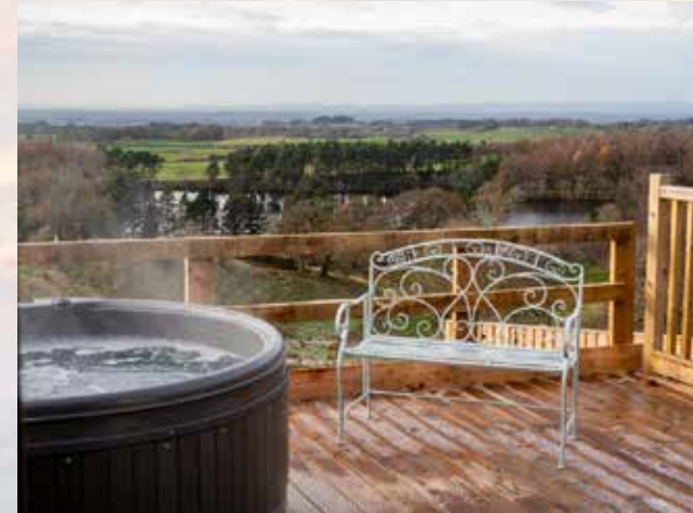
Stunning views from the elevated decking of the Scottish Mountains and Hills and The Lakes. Relax and star gaze in the Hot Tub

The Lodge also has a bathroom with shower and a private secure garden. Kekaroka Lodge has Starlink Satellite Internet.