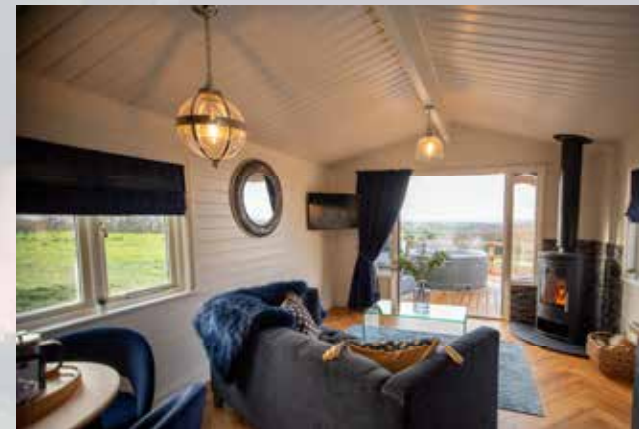
Relax in the cozy lounge area with the wood burner while tasting the local fudge!